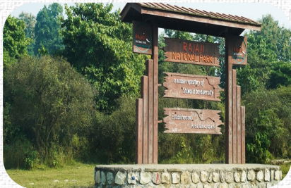
RAJAJI NATIONAL PARK

Located on the banks of river Yamuna, History fanatics, as well as architecture buffs, can have a ball here with the sheer expanse of the Mughal art and culture on display.