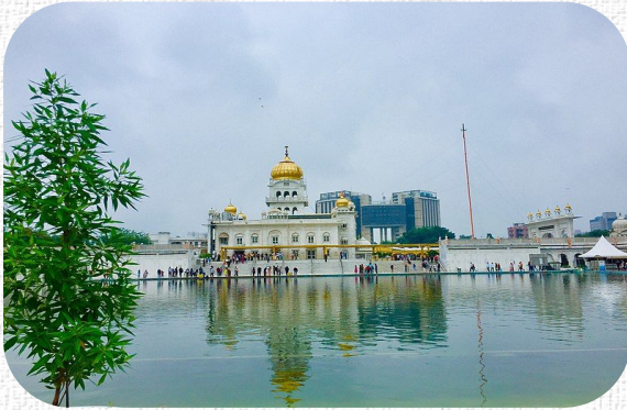
SHRI BANGLA SAHIB GURUDWARA

Gurudwara Bangla Sahib is one of the most prominent Sikh gurdwara, or Sikh house of worship, in Delhi, India, and known for its association with the eighth Sikh Guru, Guru Har Krishan, as well as the holy river inside its complex, known as the "Sarovar." It was first built as a small shrine by Sikh General Sardar Baghel Singh in 1783, on the bungalow donated by king Raja Jai Singh of Amer, who supervised the construction of nine Sikh shrines in Delhi in the same year, during the reign of Mughal Emperor, Shah Alam II.