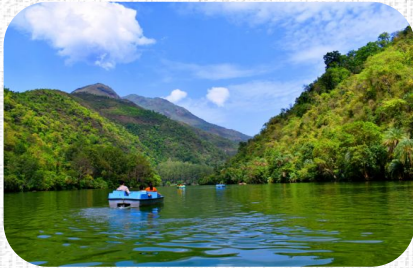
NAHAN - HIMACHAL PRADESH

249 kms from Delhi - The impressive hamlet of Nahani, cradled amidst the snow-covered Shivalik Himalayan Range, is one of the many picturesque hill stations in Himachal. Away from the dreary life of the crowded cities, it is blessed with lush green meadows, amazing weather, winding trails, vintage temples, gorgeous lakes, and a dreamy and romantic vibe. For those seeking some dose of adventure, Nahani makes a good base for treks in the upper echelons of Himachal, from where you can trek to the Churdhar Peak. Also, the renowned Sikh temple, Paonta Sahib Gurudwara lies at an hour's drive from Nahani and makes for a calm spiritual retreat for all the distressed souls.