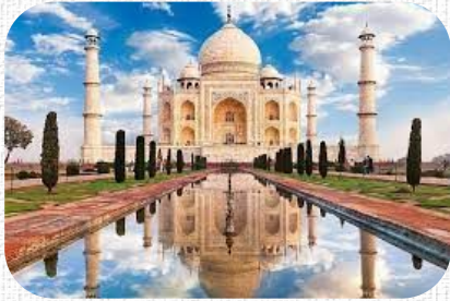
TAJ MAHAL - AGRA

210 kms from Delhi – Home to one of the 7 wonders of the world, the Taj Mahal, Agra is a sneak peek into the architectural history with other UNESCO World Heritage Sites as Agra Fort and Fatehpur Sikri. History, architecture, romance all together create the magic of Agra and hence makes for a must-visit for anyone living in or visiting India.